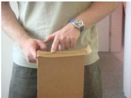
4. Press and smooth the tape down both edges.