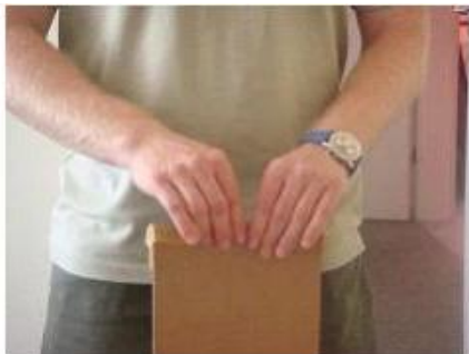
5. Press and smooth the tape down both front and back faces.