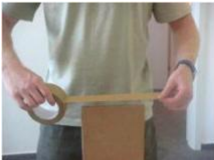
1. Hold the cut edge upwards. Roll out the tape with a 3 to 5cm overhang at each side.

PhoneStar cut edges must be immediately taped after each single cut, in order to seal the sand filler. Otherwise the final performance of the PhoneStar sound insulation system may be compromised.