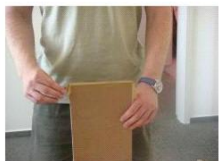
6. Fold in the remaining wings onto both front and back faces.

A professionally cut and taped PhoneStar board, which is simple to do.