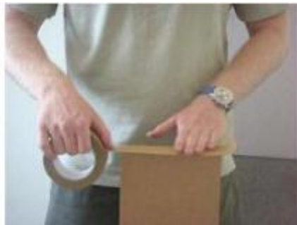
2. Press and smooth the tape down onto the cut edge.