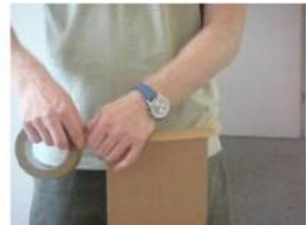
3. Tear the tape to length.